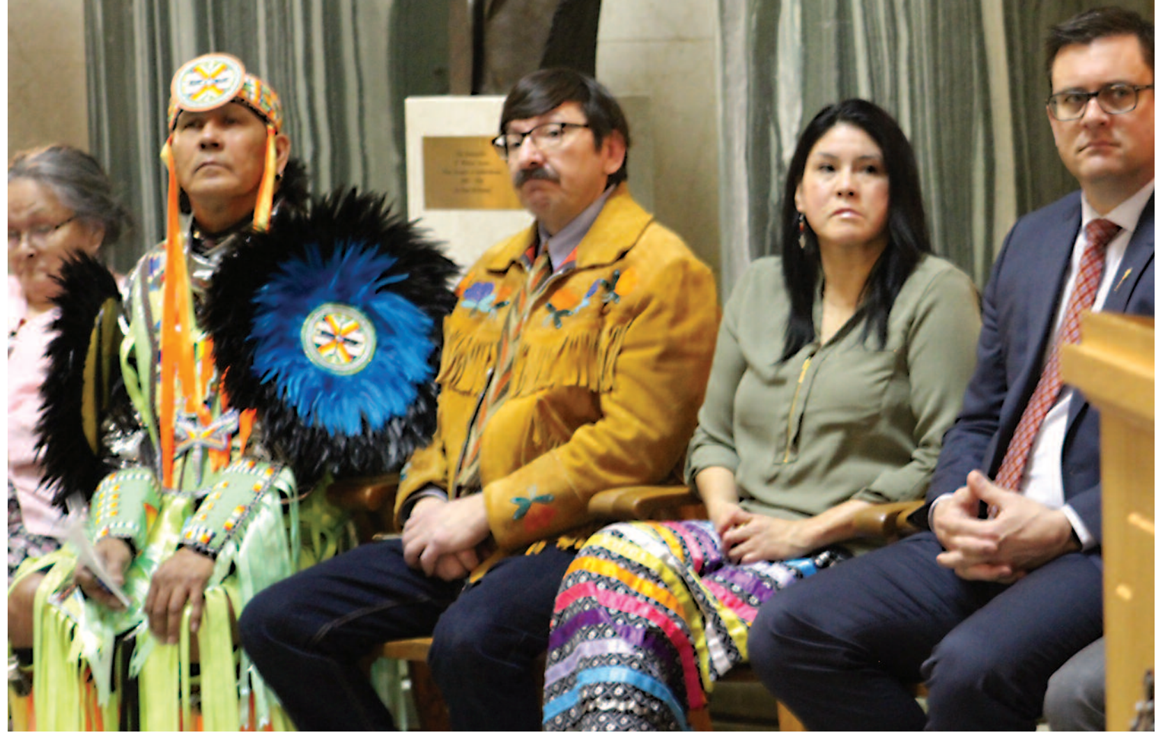
Sixties Scoop survivors and special dignitaries sat in the front during Premier Scott Moe's apology.

The Sixties Scoop refers to a period in Cana-